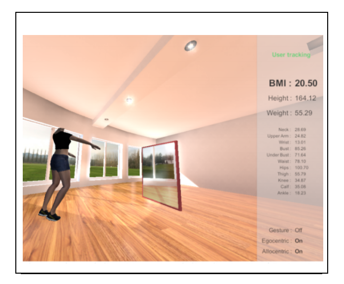
Figure 2: Screen capture of how the program will be viewed from the experimendor's point of view. To the right of the image we can see each one of the parts of the body with its measurements.

as nails. The avatars are Caucasian, and wear jeans and a short-sleeved T-shirt, with blue shoes.