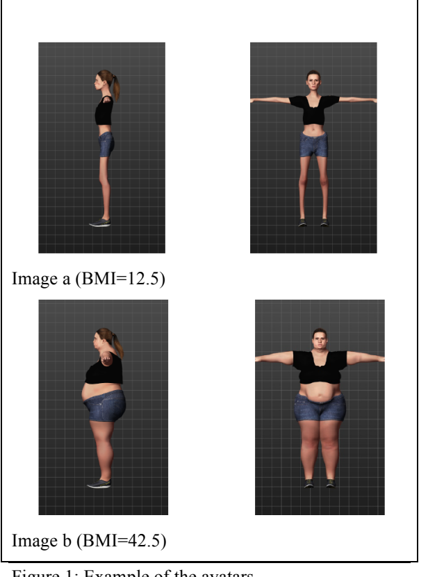
Figure 1: Example of the avatars.

Figure 2: Screen capture of how the program will be viewed from the experimendor's point of view. To the right of the image we can see each one of the parts of the body with its measurements.